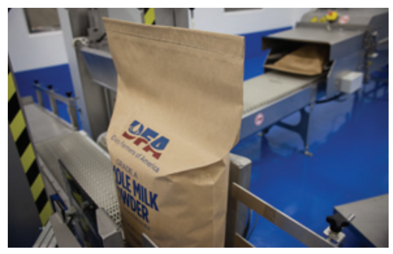
■ Employees at DFA's new milk powder plant in Fallon, Nev., can fill six 25-kilogram, oxygen-free bags of powder every minute. These are trucked to Oakland, Calif., and loaded on container ships bound for China and other countries.

suppliers. Buying from the U.S. would diversify their supply and reduce their risk. It was a tough sell.